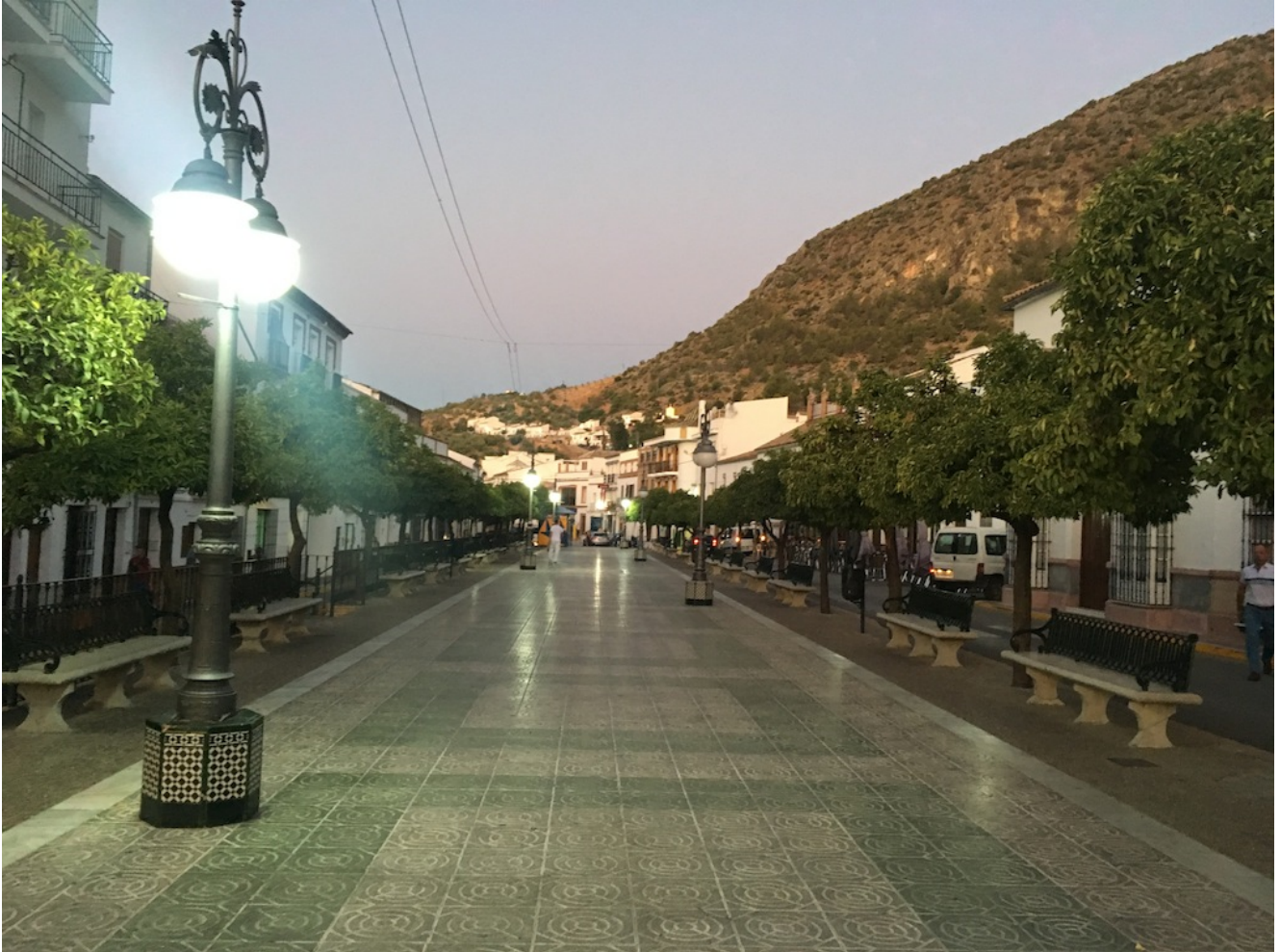
Plaza de la Constitución

For this route we will meet at 10.30 a.m. in the center of Algodonales at the Plaza de la Constitución in the Asturian bar next to the church of Santa Ana, whose coordinates are 36.880920,-5.405866. The picture of the Plaza is below.