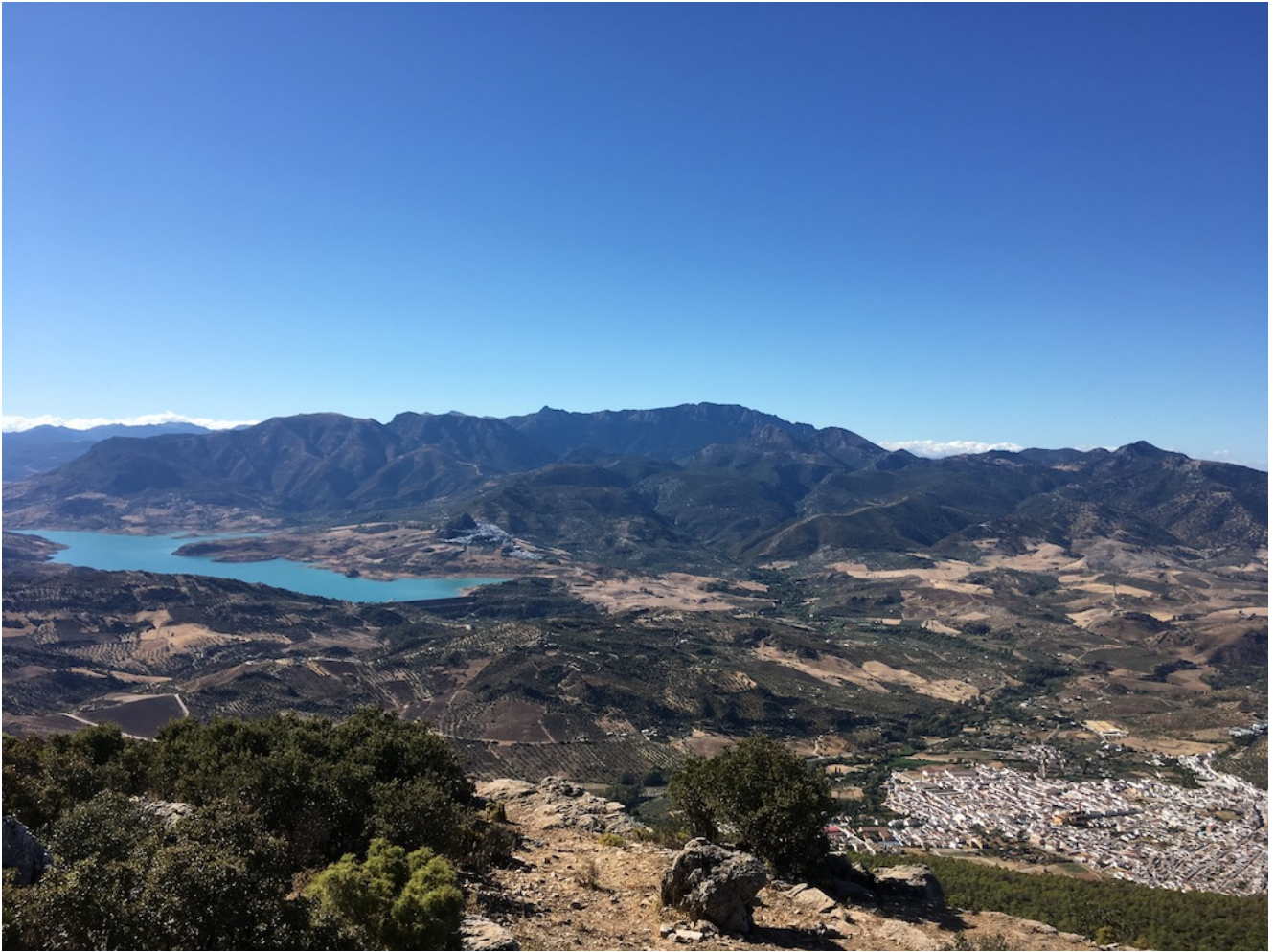
Vista desde el Mirador de Levante

This is the midpoint of the trip, and from now on the route will be between rocks and roads, taking us to the viewpoint of Poniente, where we stop to eat and from there the descent to Algodonales.