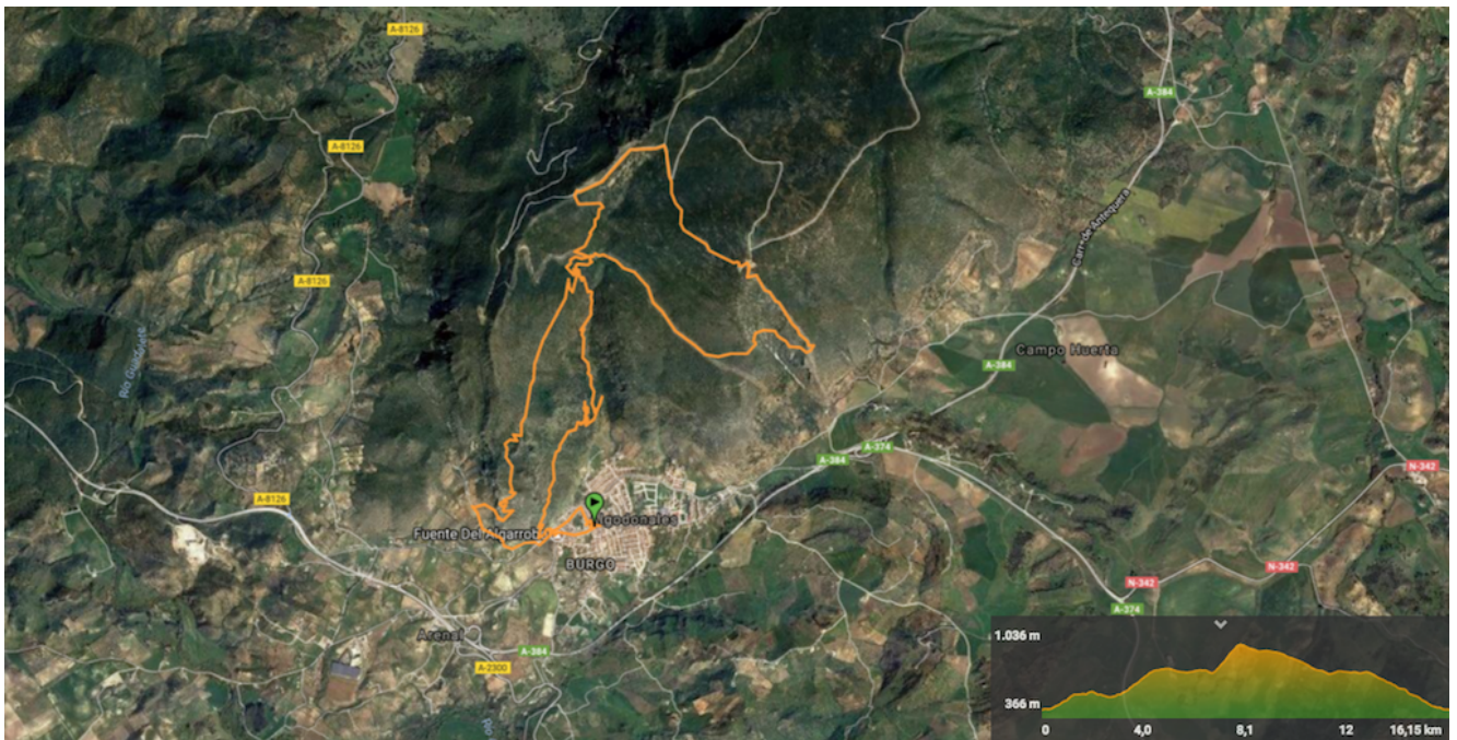
Track de la ruta