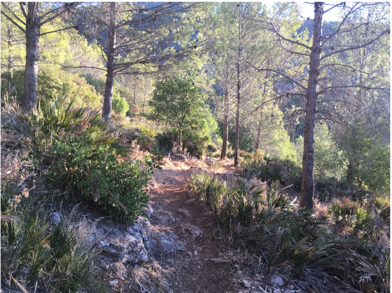
Imagen del camino

Level three-28 January. The route of the Algodonales Víboras Trail (which translates literally as “Cotton Snakes Trail”) is a homage by us to one of the most testing routes in Andalusia. At 16 km in length and 916 meters of accumulated ascent, this route is a level three, and is a specialty trip that can only be accessed by club members. We will use shared cars to reach the walk.