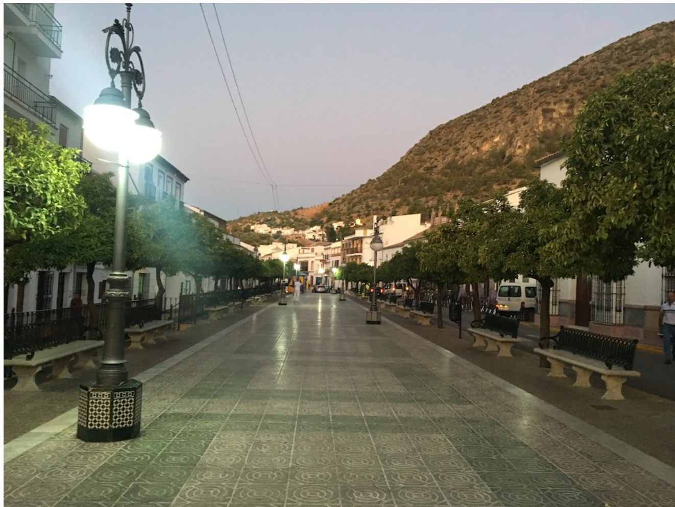
Plaza de la Constitución

For this route we will meet at 10.30 a.m. in the center of Algodonales at the Plaza de la Constitución in the Asturian bar next to the church of Santa Ana, whose coordinates are 36.880920,-5.405866. The picture of the Plaza is below.