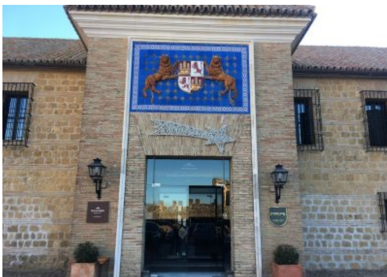
Entrada del Parador

After the stop we continue back until we reach Carmona at approximately noon with a visit to the Parador Alcázar del Rey Don Pedro where our tour ends.