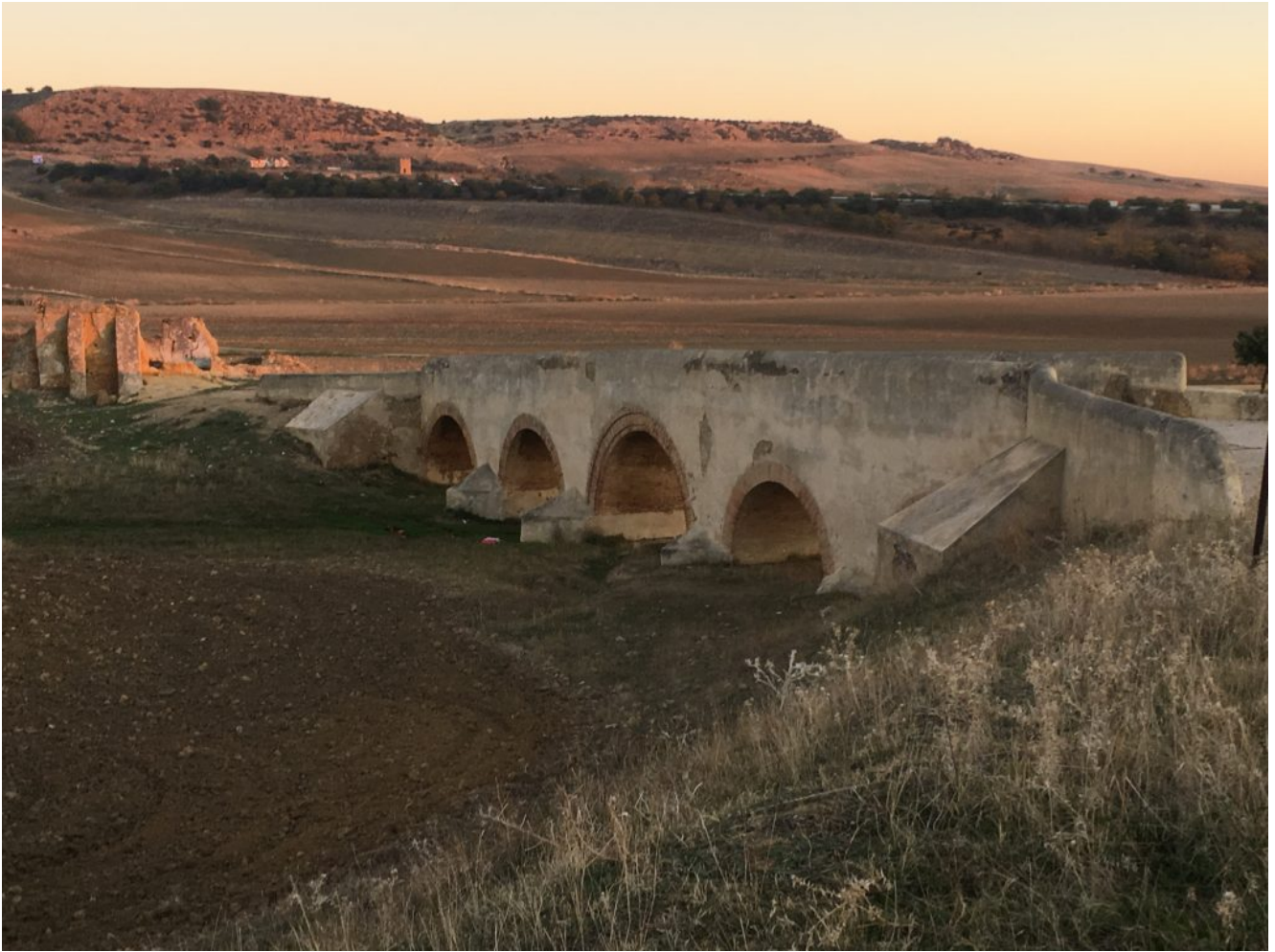
Puente de los Cinco Ojos

After some uphill walking, we'll reach the Batida Caves plus an impressive quarry site with magnificent scenery, affording beautiful panoramic views of Carmona at the edge of the ravines. We'll stop here for a break.