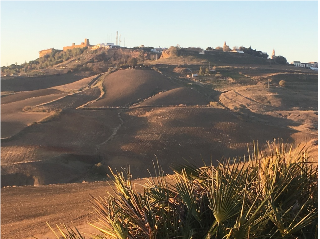
Carmona view from caves

We will start at 10.30a.m. from the Parador Alcázar del Rey Don Pedr, the GPS coordinates are 37.472652, -5.632608, see the picture below.