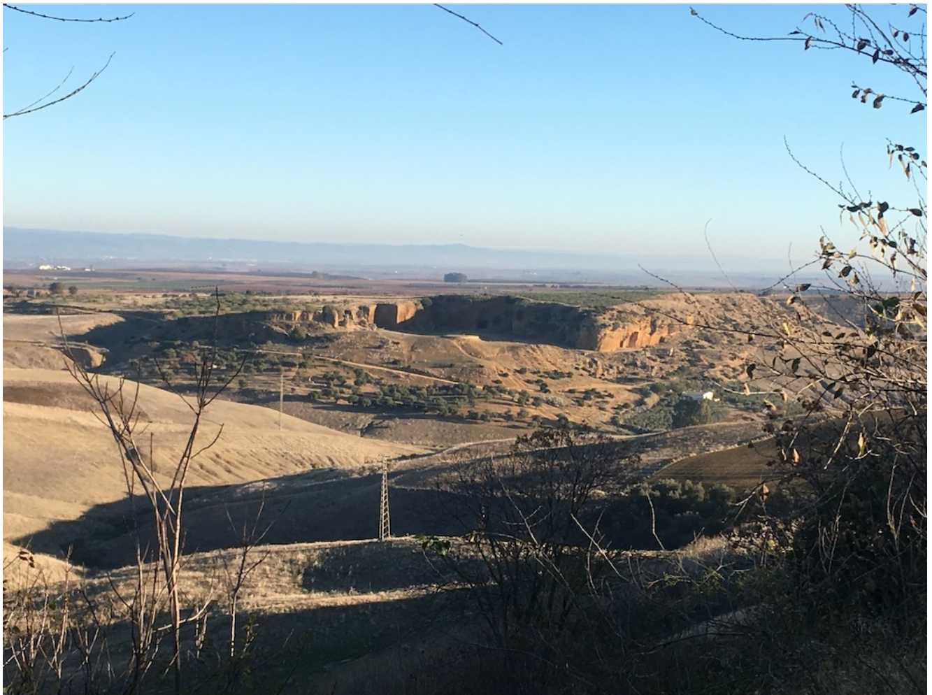
Caves view from Carmona

Level one – January 20 2018. Las Cuevas de la Batida is an excursion through the city of Carmona and its surroundings, where we'll visit both the town center with its parador and the caves. It's a 9km route with 190 meters of ascent . We'll travel to Carmona by public bus leaving from the Plaza de Armas at 8.45 am.