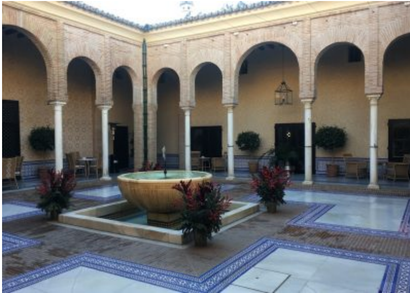
Patio del Parador