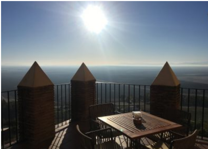
Vista desde la terraza