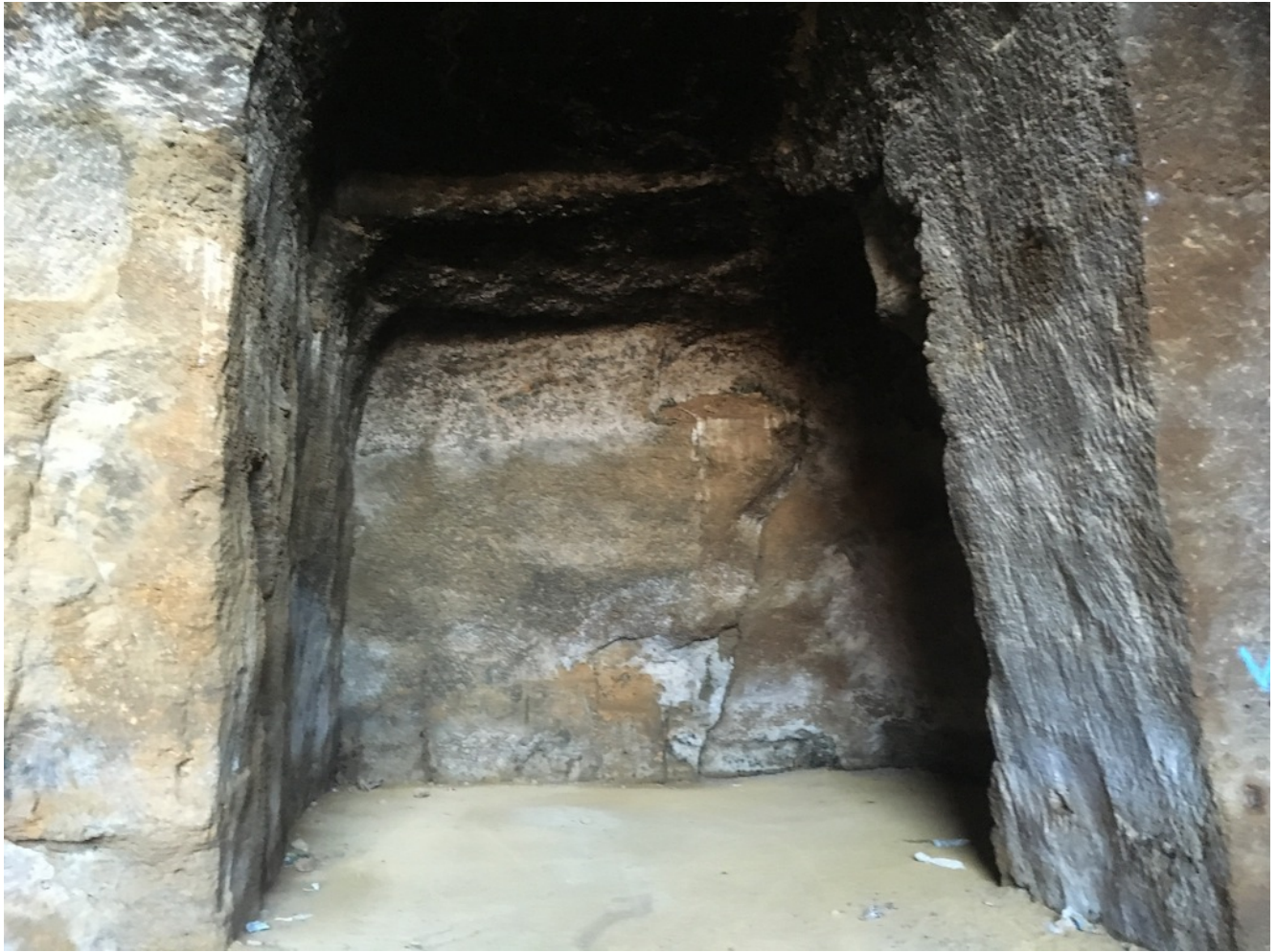
View of the Caves

After the stop we continue back until we reach Carmona at approximately noon with a visit to the Parador Alcázar del Rey Don Pedro where our tour ends.