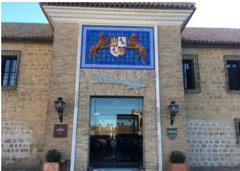
Entrada del Parador

After the stop we continue back until we reach Carmona at approximately noon with a visit to the Parador Alcázar del Rey Don Pedro where our tour ends.