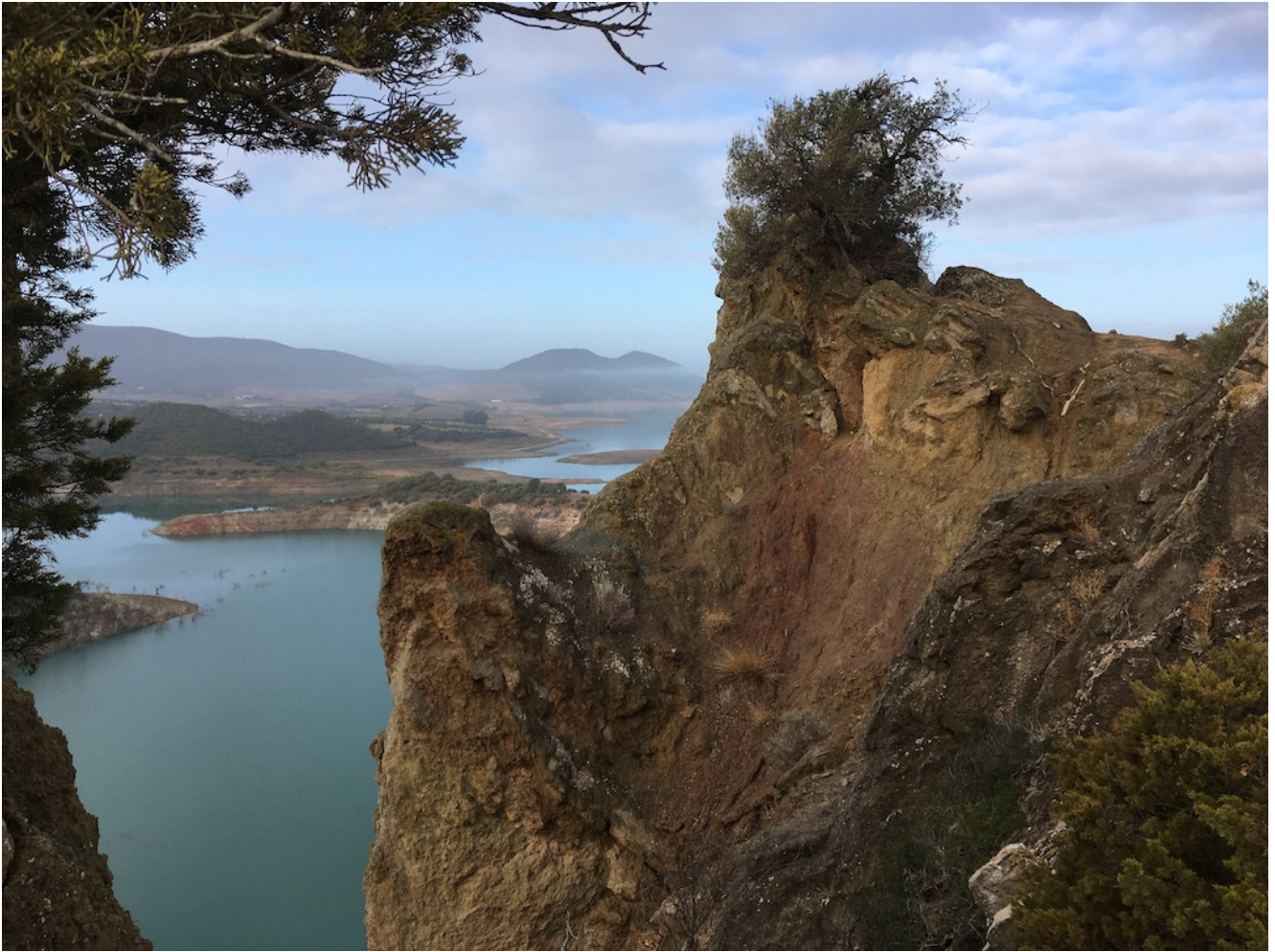
Landforms in front of the water