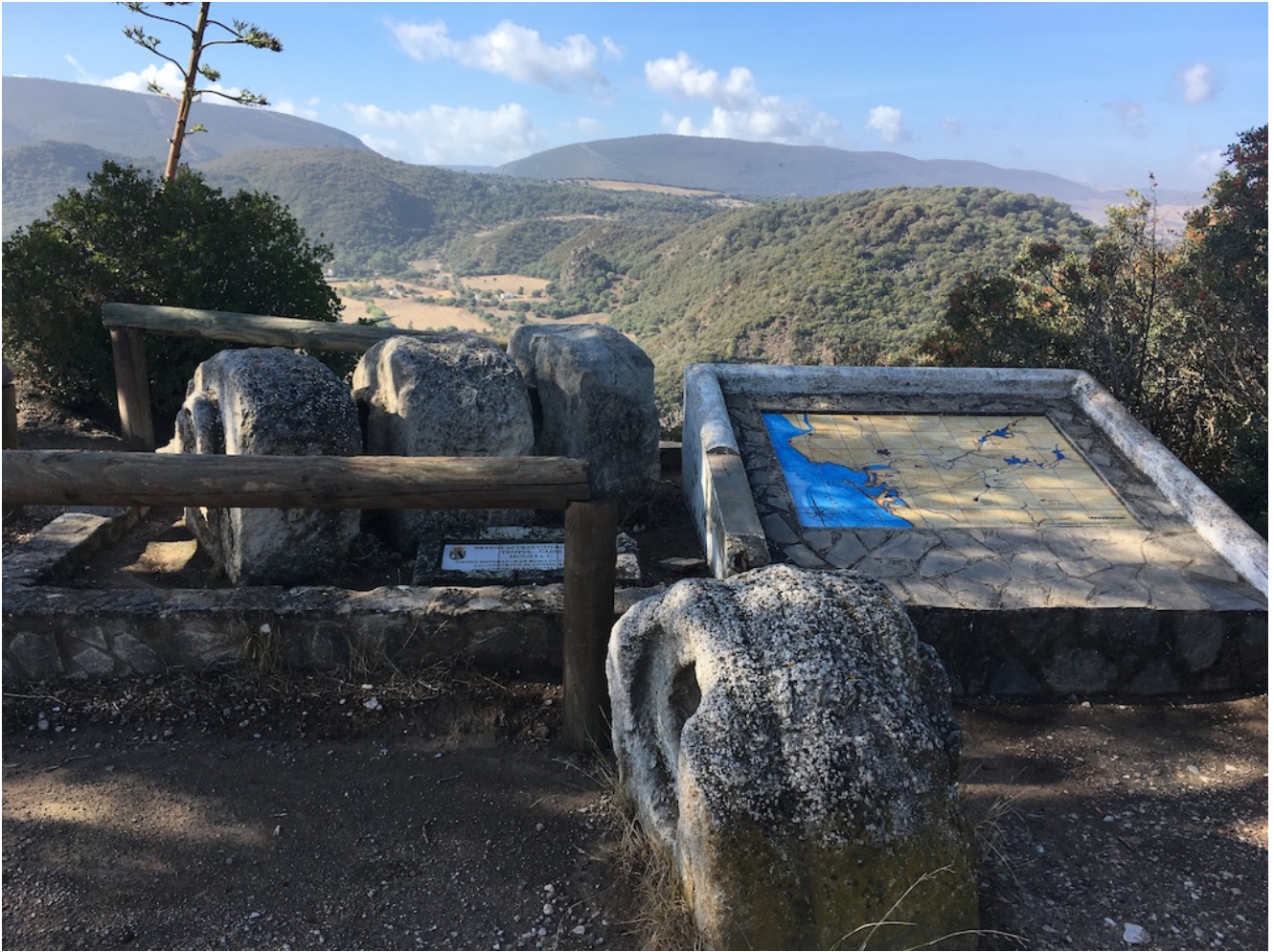
Aqueduct remains from Tempul

The price of this trip starts from 20 euros with bus and 8 euros without bus . The bus trip will have three stops for pick up in Seville. The departure times are as follows: Metro de la Gran Plaza at 8 a.m., José Laguillo (opposite the Santa Justa Hotel) at 8:15 a.m., and the Ronda el Alamillo Brewery at 8:30 a.m. If you would like to come you have to complete the registration process. In order to do this, you can make a payment by card (click the button below) or by transfer into our account: BBVA ES35 0182 3299 8102 0160 5087. Please send us your reservation to our email: info@senderismo Sevilla.net with your full name, ID number, date of birth, and phone number.