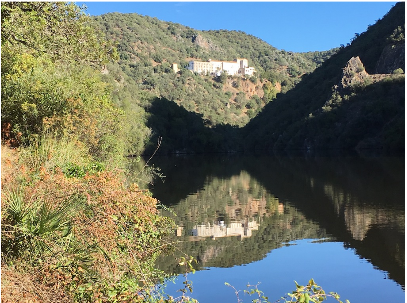
Seminario de los Angeles

The price of this excursion is €30 with bus and boat ride (€22 for club members) and €8 just for hiking. There are three bus pick up points in the morning; 7.00 a.m. at the Café Gran Plaza, 7:15a.m. Calle Jose Laguillo in front of the hotel Santa Justa and 7.30 a.m. at the Cerveceria Ronda El Alamillo. We will be returning leaving Hornachuelos at 17 hours.