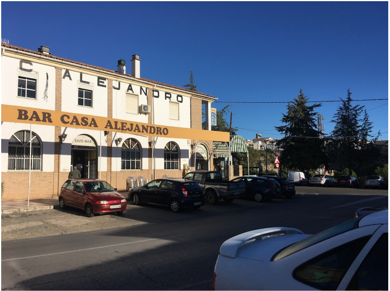
Bar Casa Alejandro