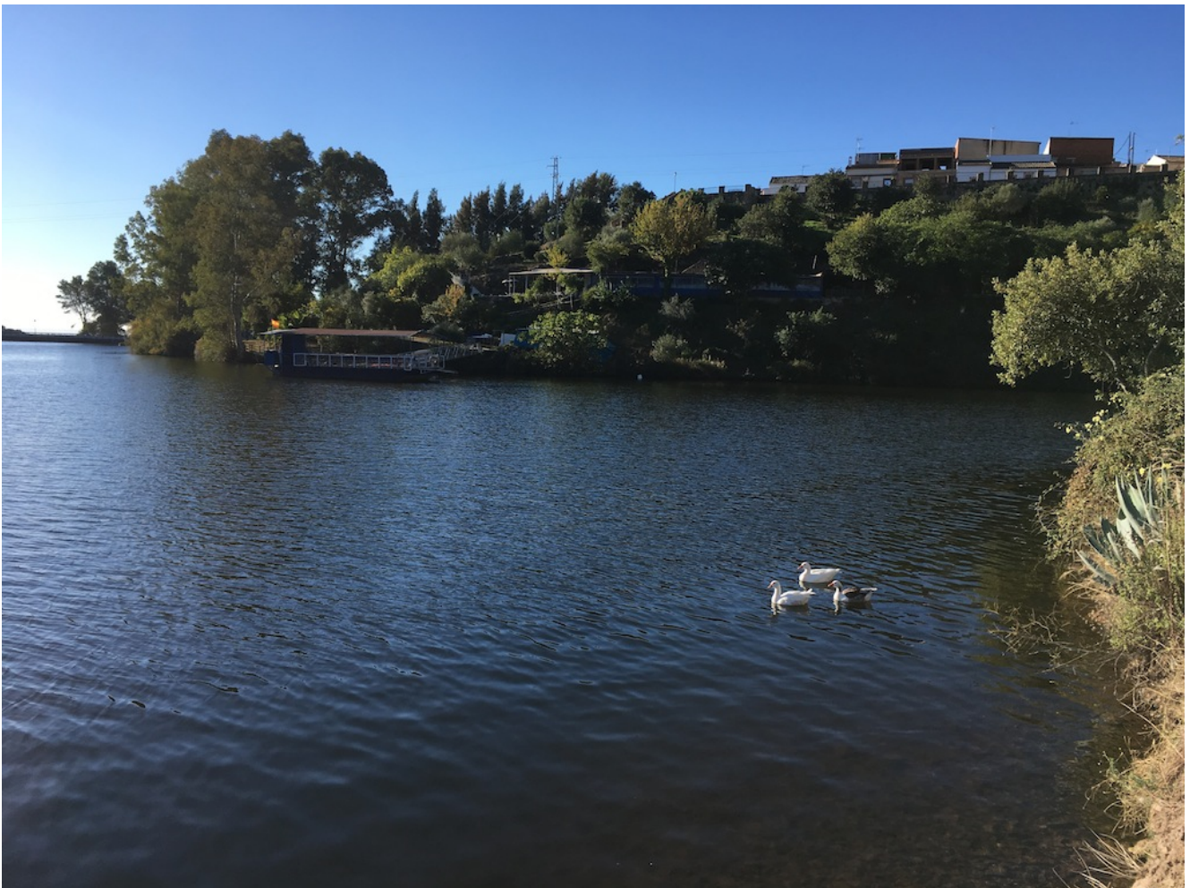
Embalse de Bembezar

We begin our 2018 season with the “Los Angeles Trail”, a 12 km linear there and back route including 200 meters of ascent , following the riverbed of the Bembezar Reservoir. It is an easy level two excursion, and includes a lovely hour and a half boat trip. It’s an ideal introduction to the walking season! We will be providing the usual bus arrangements from Sevilla.