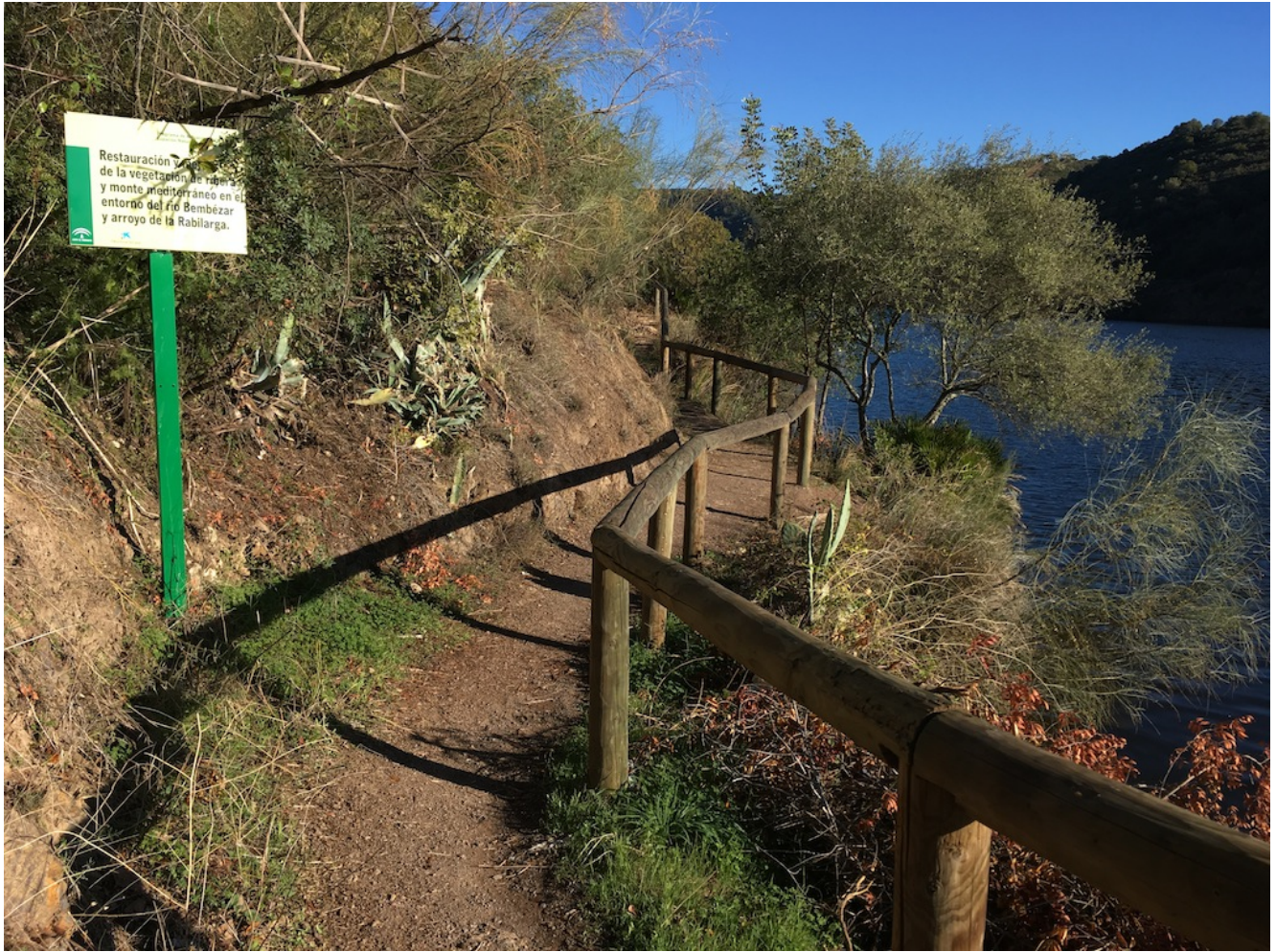
Comenzamos este precioso sender