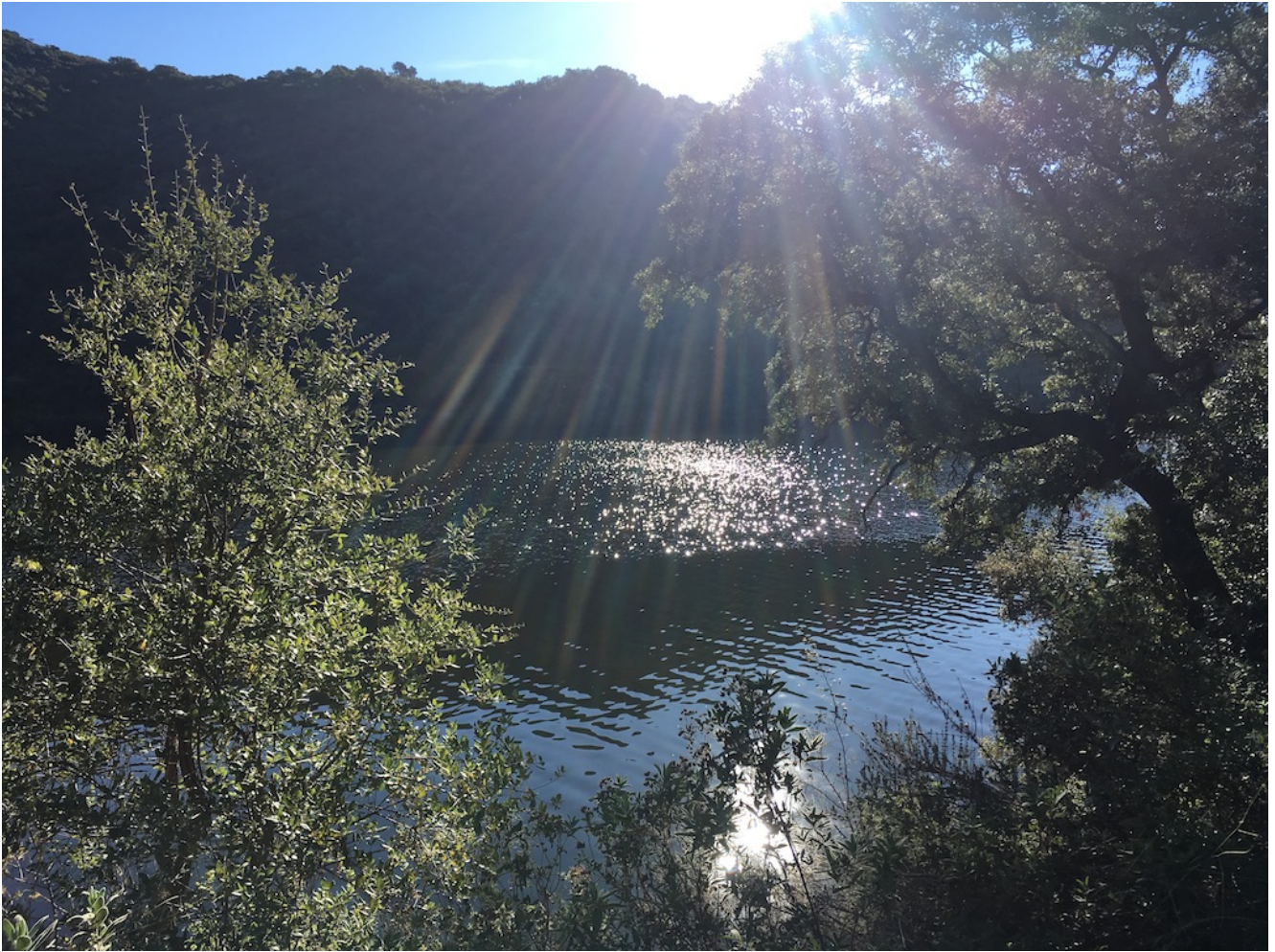
Paseo sobre el Río Bembezar