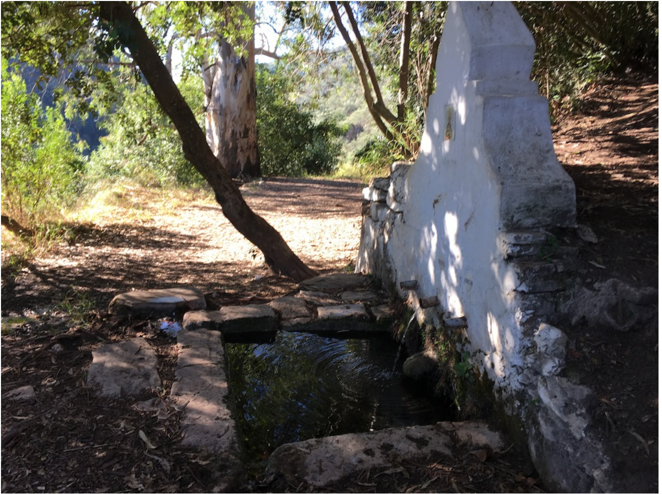
Fuente del Amor, Salud y Amistad