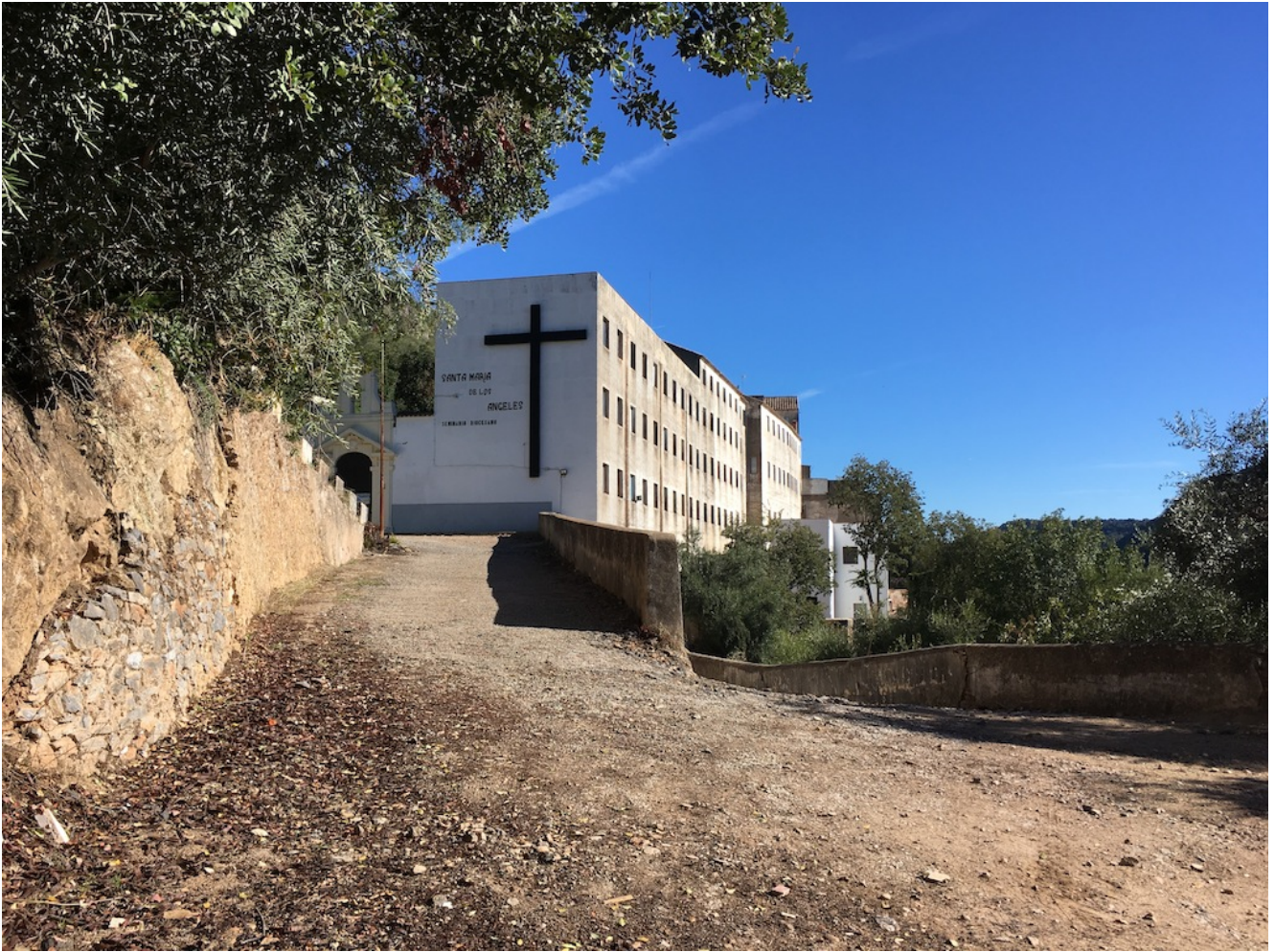
Seminario de los Angeles