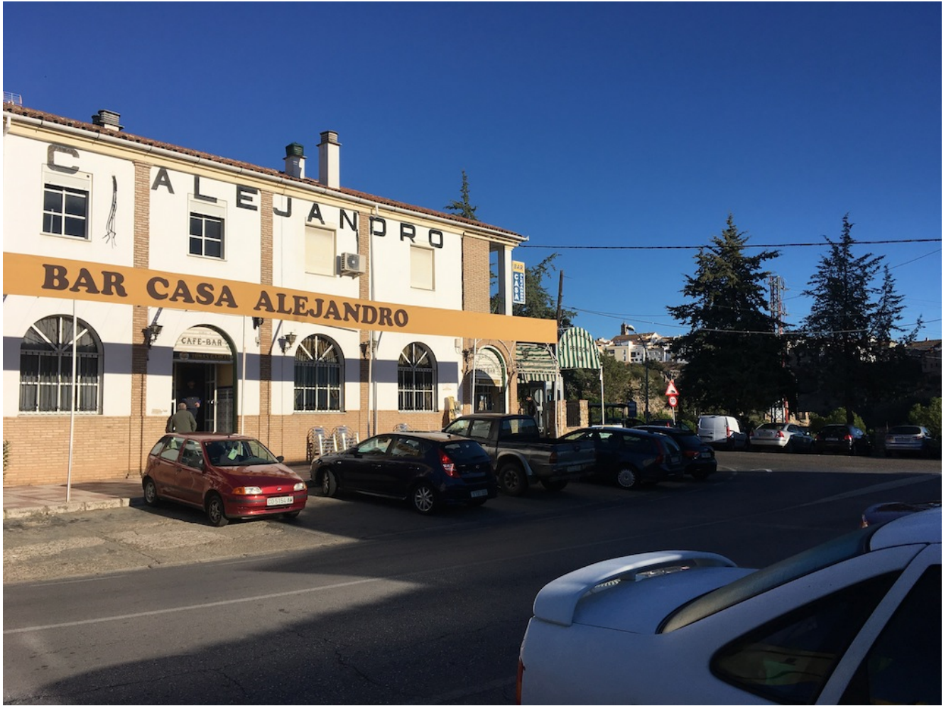
Bar Casa Alejandro