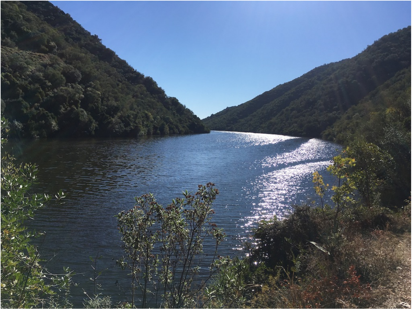
Recorrido de vuelta