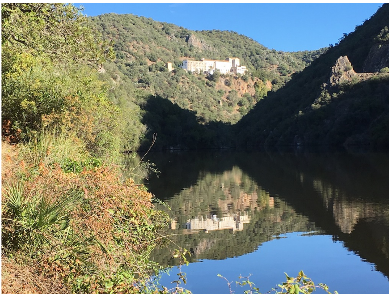
Seminario de los Angeles

The price of this excursion is €30 with bus and boat ride (€22 for club members) and €8 just for hiking. There are three bus pick up points in the morning; 7.00 a.m. at the Café Gran Plaza, 7:15a.m. Calle Jose Laguillo in front of the hotel Santa Justa and 7.30 a.m. at the Cerveceria Ronda El Alamillo. We will be returning leaving Hornachuelos at 17 hours.