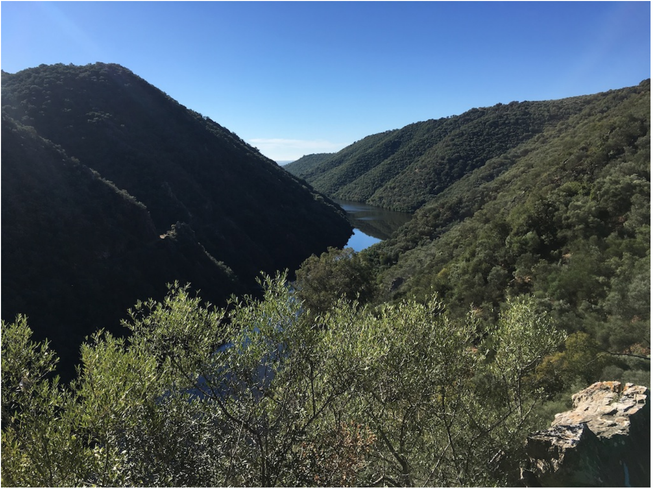
Vista desde la Cruz