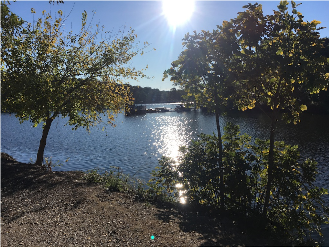
Vista desde el punto de encuentro