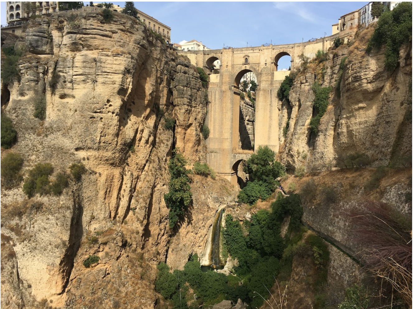
Puente Nuevo de Ronda

The Roads of Ronda is a moderate difficulty excursion taking place on Sunday November 12th. It is part of our continuing preparation towards level two, which we expect to reach by Christmas. The 16 km route which includes 500 meters of ascent, will take approximately 5 hours. Afterwards, we'll go onto eat in the city of Ronda and visit the gorge area by the river Gua Dalevin under the new bridge. We will return by bus leaving Ronda at 19.00 hours.