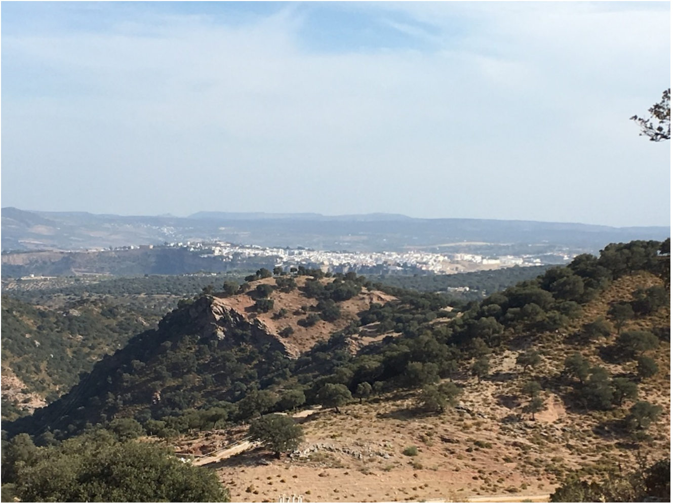
Vista de Ronda desde la sierra

Between Tajo del Abanaico and Cueva de los Aviones we travel along a medieval paved road running parallel to the stream of the Arroyo de los Chopillos. It is an area of great beauty and ideal for photography. The gorge's vast shape and size has been caused over millenia by the movement of water.