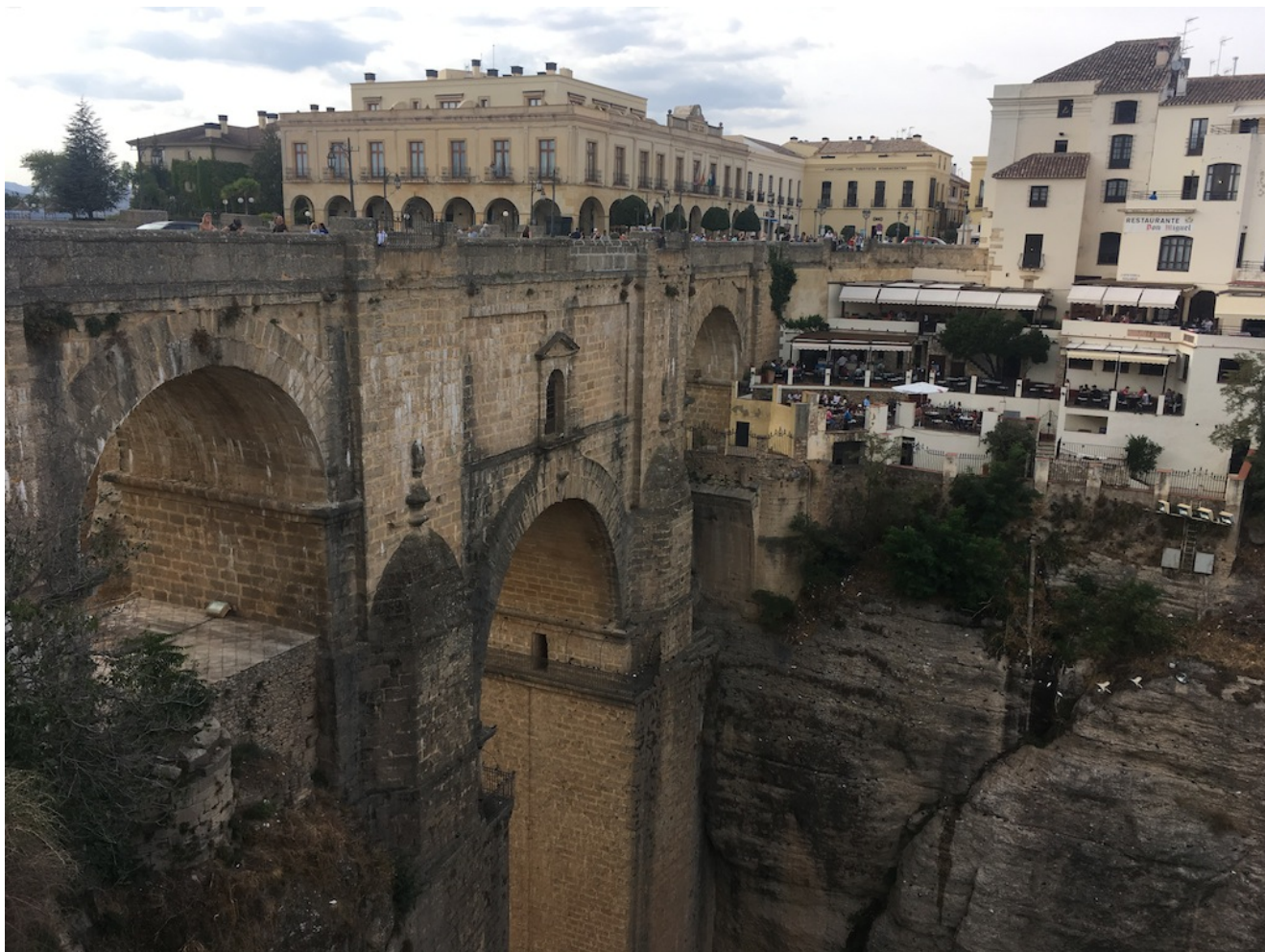
Ronda Ciudad Milenaria

dominating the gateway to Lower Andalusia. There are well preserved traces of its rich and varied history.