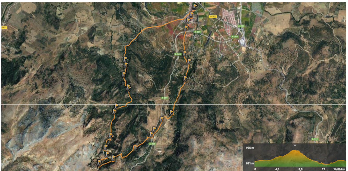
Track de la Ruta