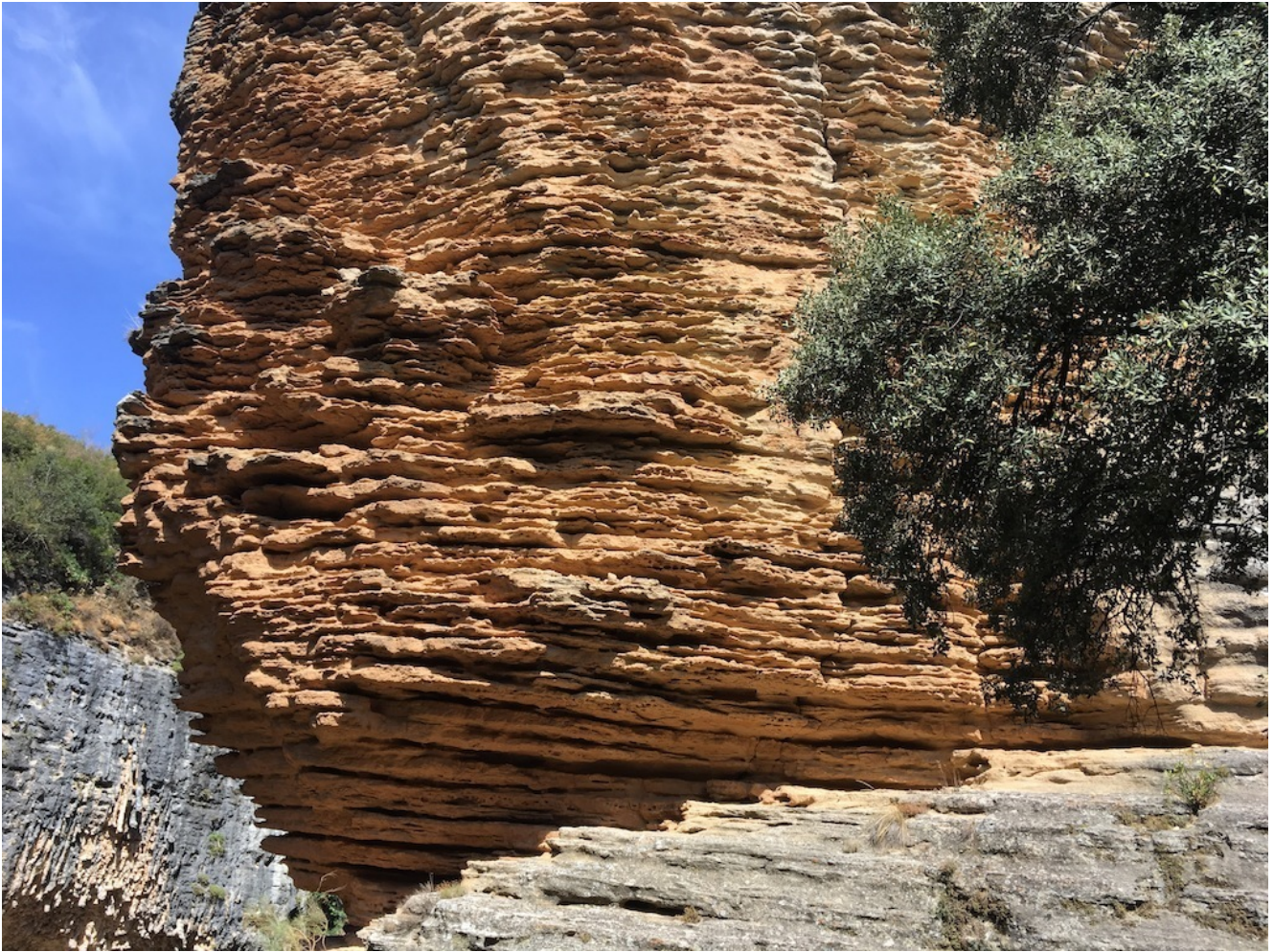
Tajo del Abanico

From there, we will have about 4 km of climbs and descents to reach the city of Ronda, certainly no later than 15.30 ready for our meal, followed by our visit to the gorge.