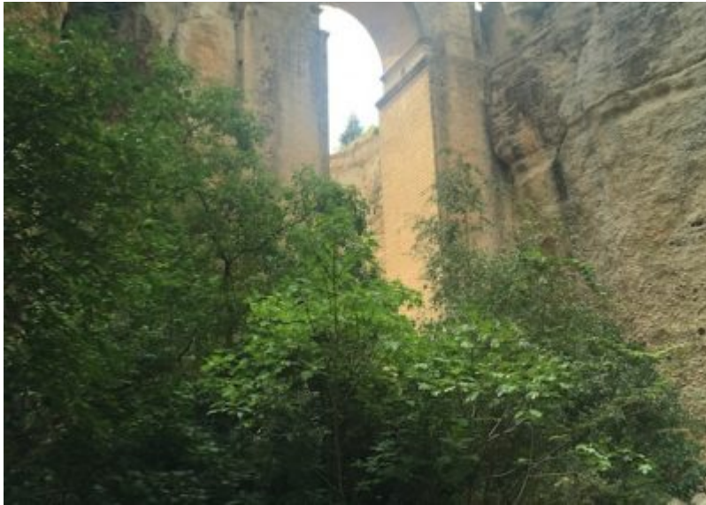
■ Puente Nuevo