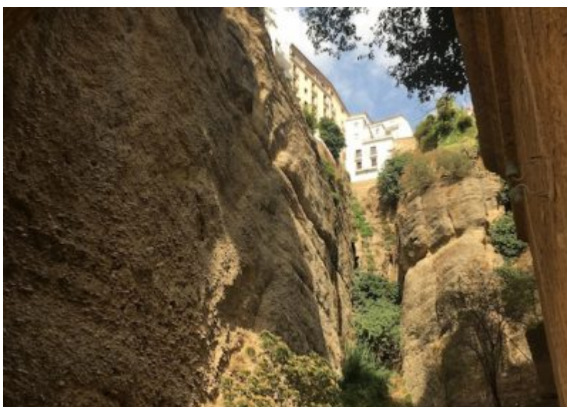
■ Puente Nuevo Ronda

From there, we will have about 4 km of climbs and descents to reach the city of Ronda, certainly no later than 15.30 ready for our meal, followed by our visit to the gorge.