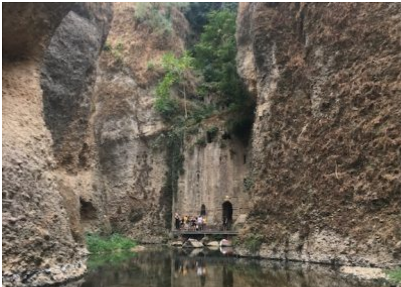
■ Laguna bajo el Puente Nuevo

This beautiful all inclusive excursion costs €32 including the bus (€24 if a group member) or €20 if you use your own transport (€12 for group members). Or for just the walk the cost is €8 (free for group members).