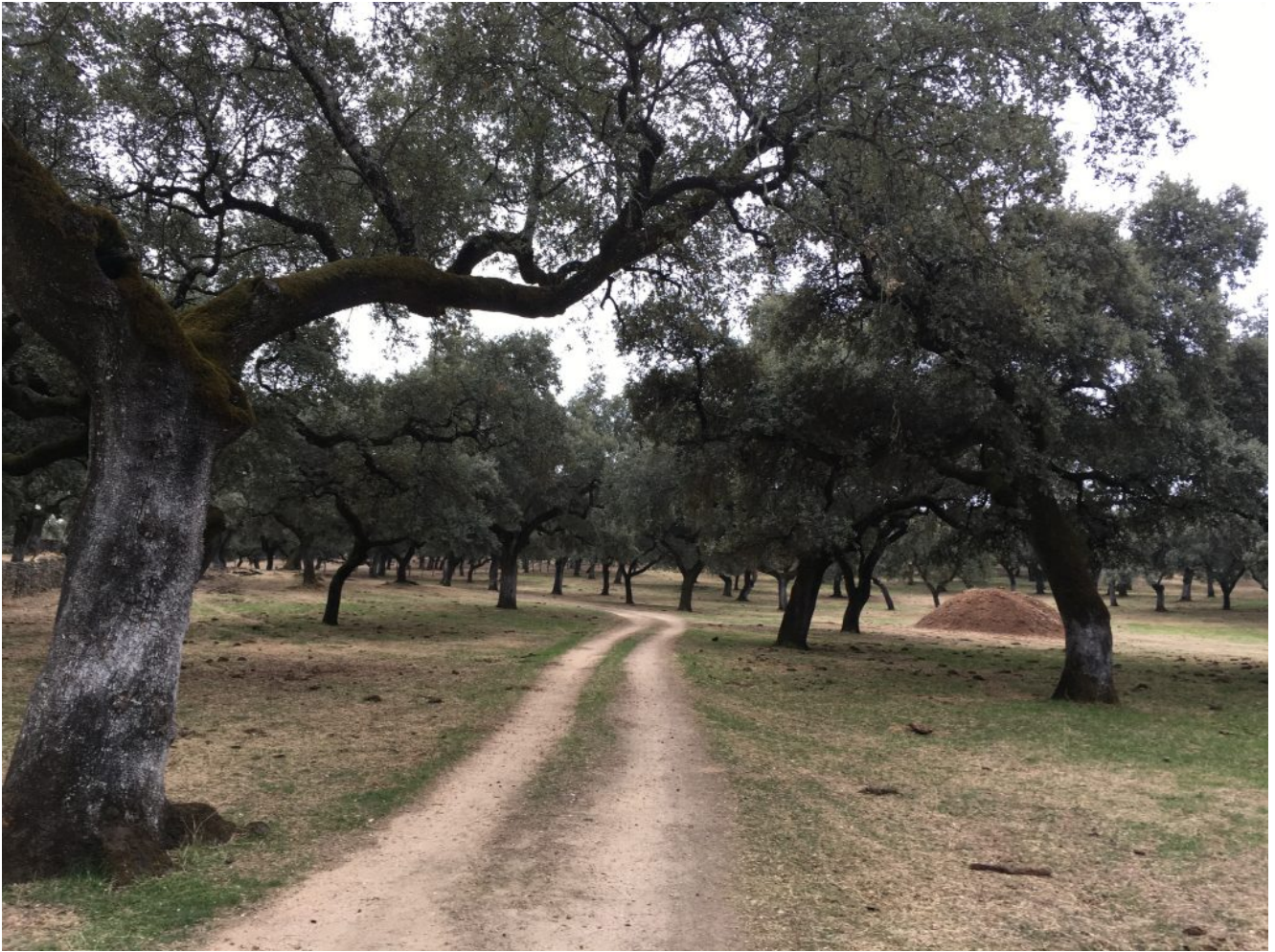
Bosque de encinas

We cross the Dehesa del Coto and arrive at the Alajar Rivera, which runs along the left bank and then we reach the Sierra del Pico.