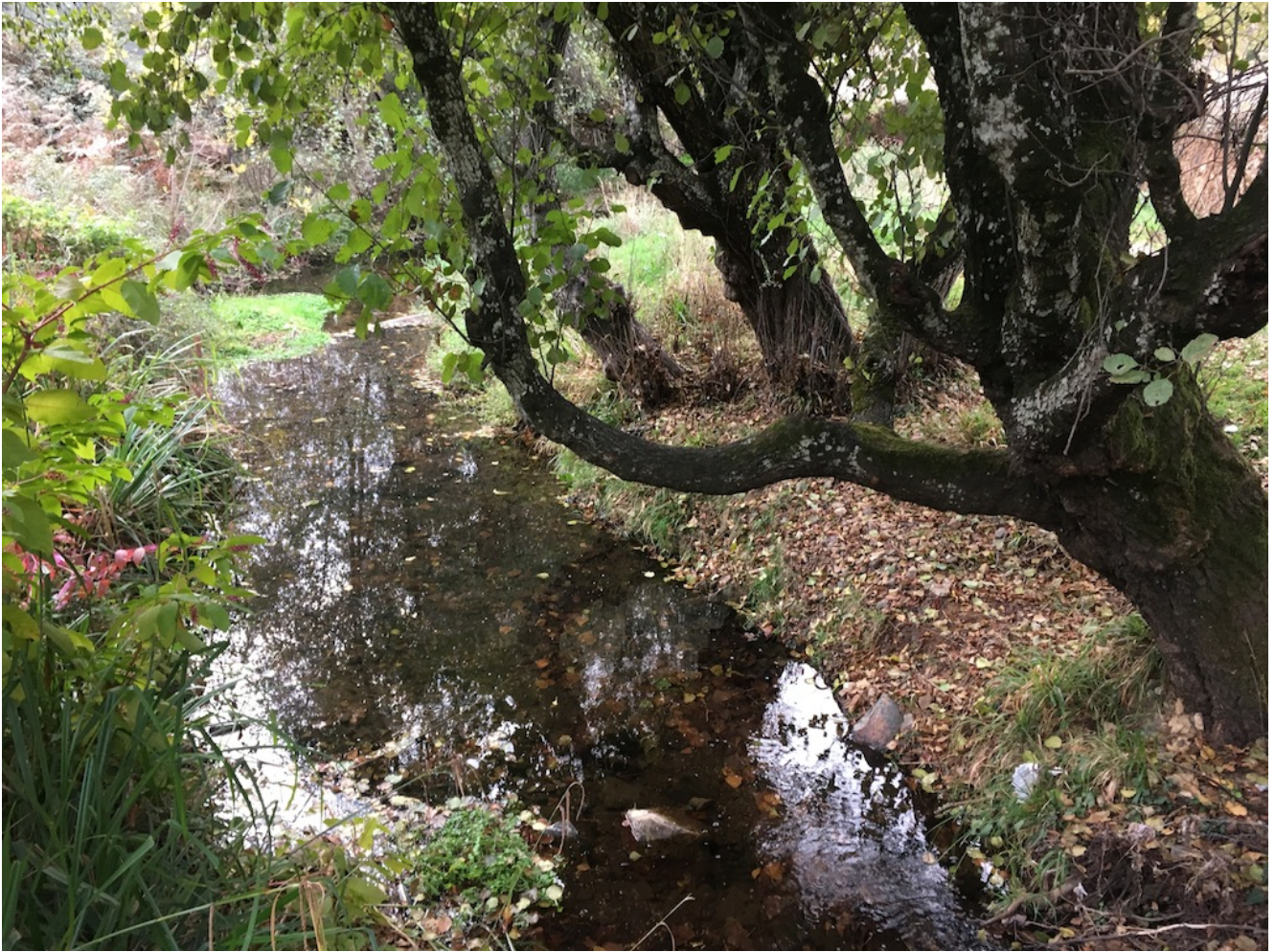
Rivera de Santa Ana