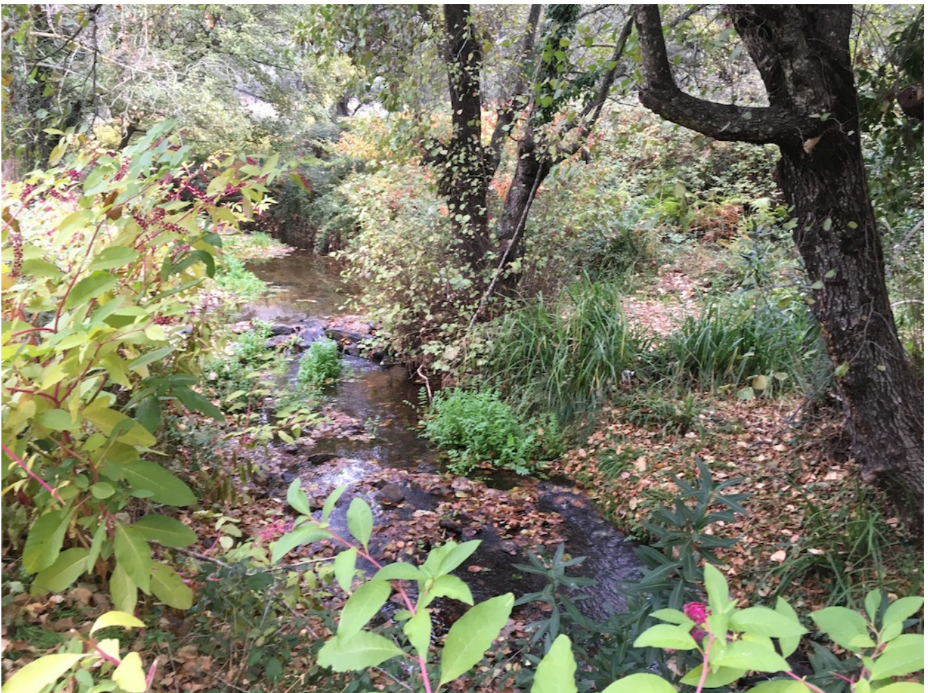
Rivera de Santa Ana

Level two, February 4th 2018. The two rivers is a beautiful excursion taking place on February 4th in the Sierra de Aracena, between the towns of Alajar and Santa Ana la Real. It's 16 km long with 310 of ascent, making this a level 2 walk. For this excursion we are providing a bus from Seville, or you can use your own car and meet us at the walk's start.