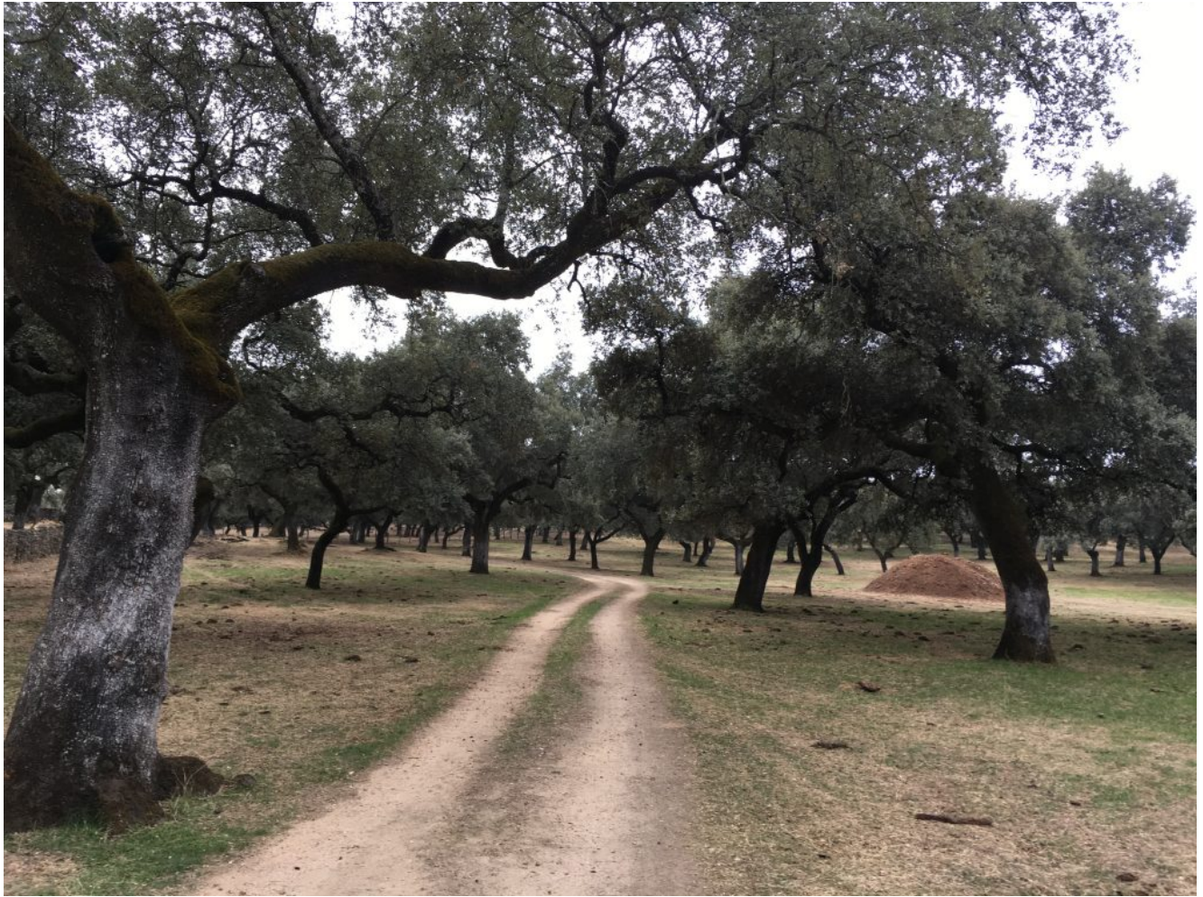
Bosque de encinas

We cross the Dehesa del Coto and arrive at the Alajar Rivera, which runs along the left bank and then we reach the Sierra del Pico.