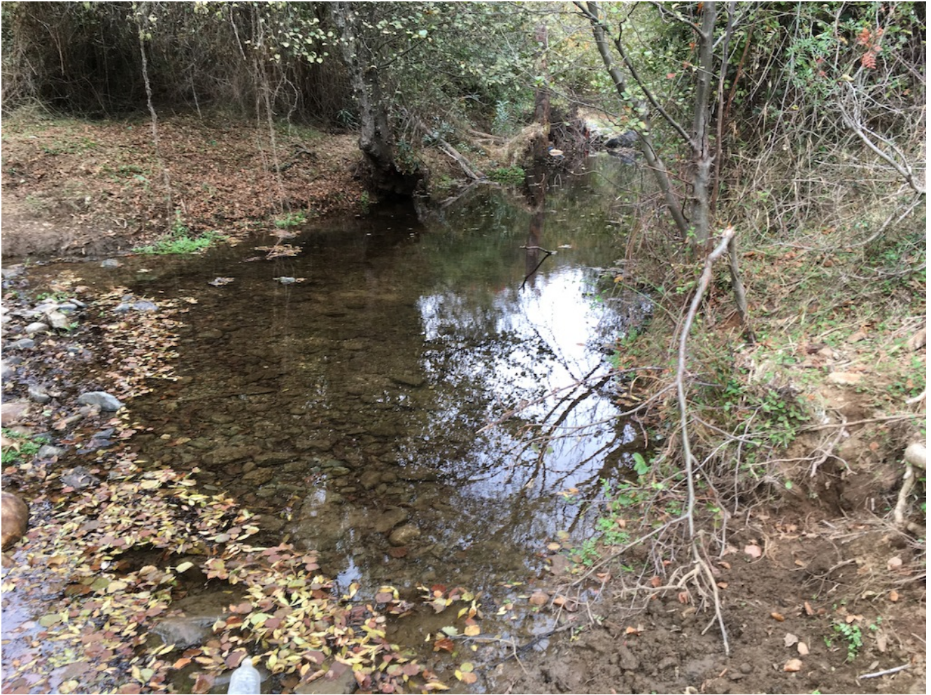
Rivera de Alajar

We'll arrive at beautiful cliffs with a flour mill, where we will change tempo to go up to the Cabezuelo, being the highest point of this excursion.