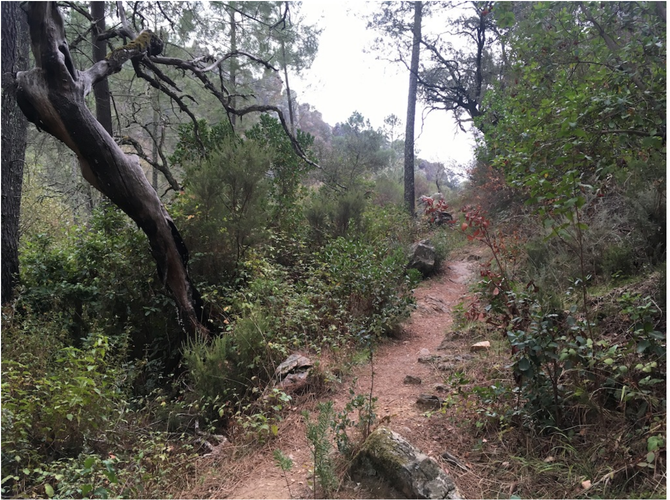
Camino hacia los Riscos de Levante