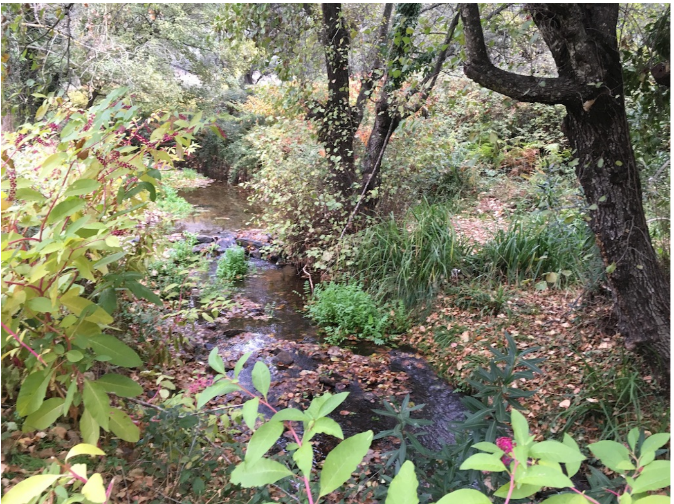
Rivera de Santa Ana

Level two, February 4th 2018. The two rivers is a beautiful excursion taking place on February 4th in the Sierra de Aracena, between the towns of Alajar and Santa Ana la Real. It's 16 km long with 310 of ascent, making this a level 2 walk. For this excursion we are providing a bus from Seville, or you can use your own car and meet us at the walk's start.