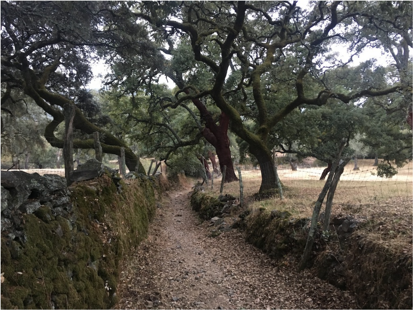
Bosque de Aracena

We start at 10 a.m. on the outskirts of Alajar at a spot called El Cabezuelo, next to the HU8105 road, 1 km from the town heading into Santa Ana, where the bus will leave us. El Cabezuelo is next to Barranco de la Tejonera, and the GPS coordinates are 37.869471, -6.680881. See the picture below.